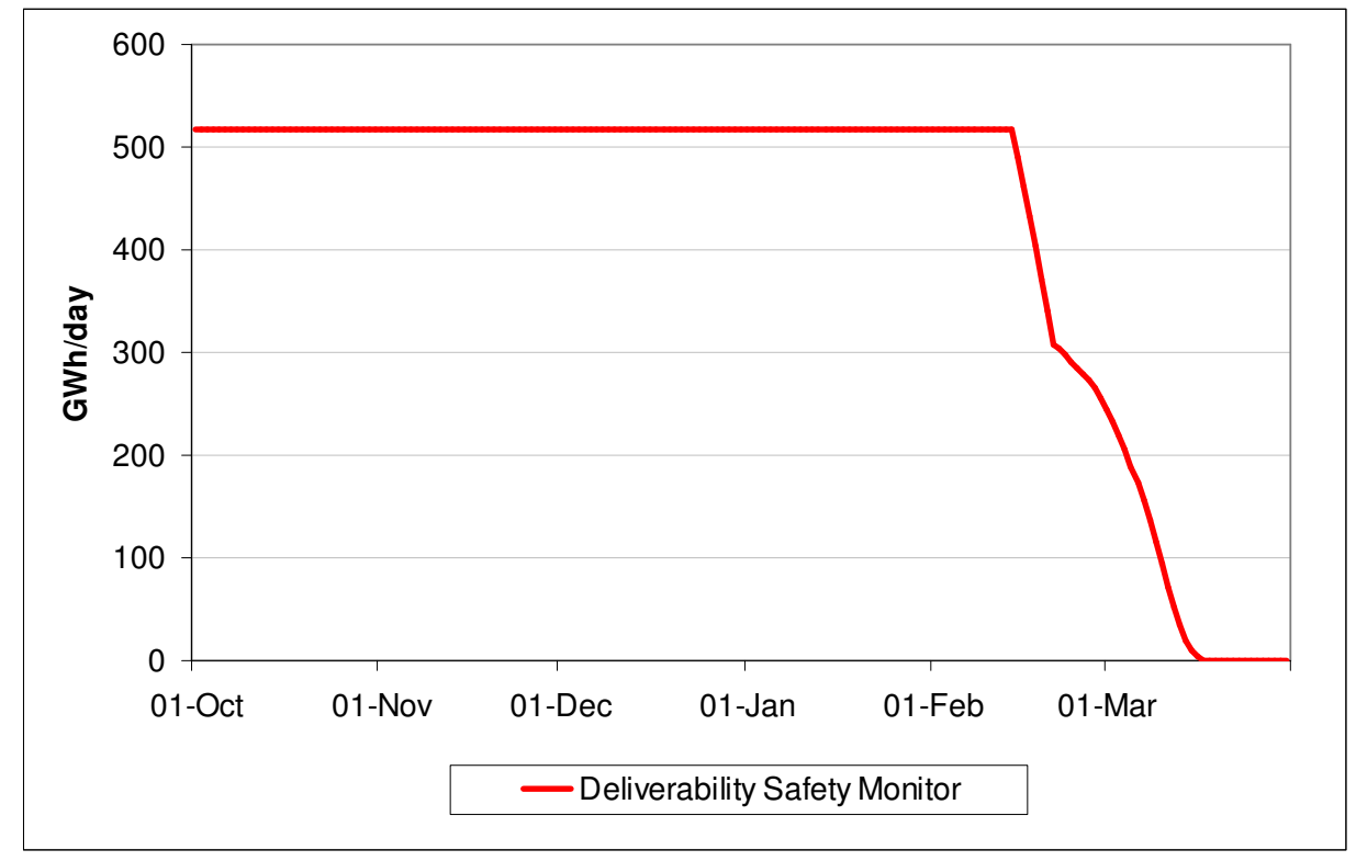
Figure 3: Deliverability Safety Monitor profile