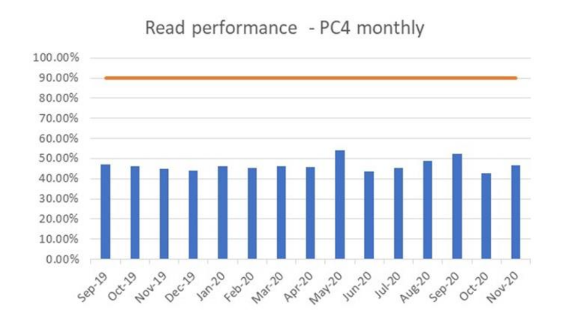
Figure 1: PC4m read performance against UNC requirement

As can be seen from the below graph, meter read performance for the monthly read PC4 market has been and remains significantly below the requirements of the UNC.