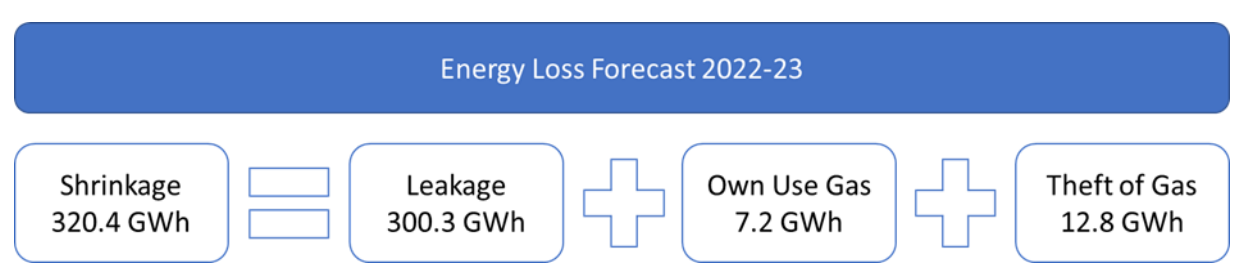
Figure 2: Breakdown of Shrinkage

WWU's Energy Loss proposals are forecasted by calculating the forecasted Shrinkage for the respective Formula Year. The below diagram provides a high-level breakdown of Shrinkage gas with values forecasted for 2022-23.