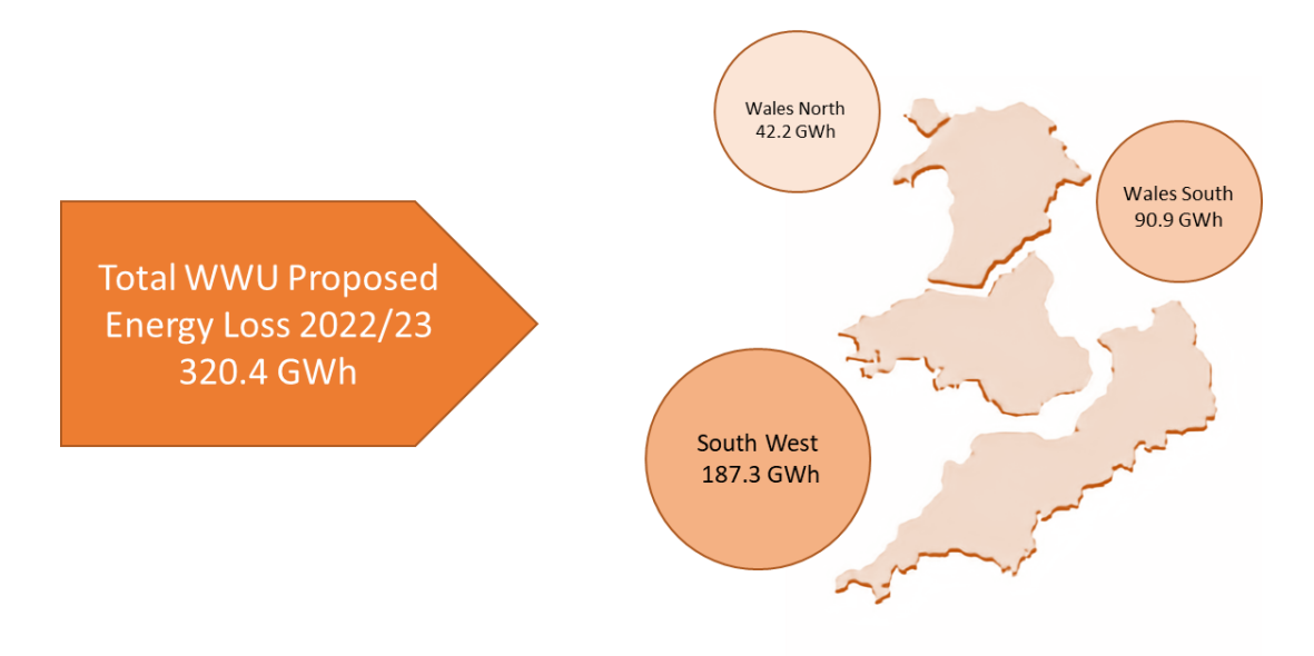
Figure 1: Breakdown of Energy Loss by LDZ

Fugitive emissions of gas (leakage and venting) have been estimated using forecast asset population as at 31st March 2022. WWU has considered Own Use Gas (OUG) and Theft of Gas (ToG) and propose using the same factor as previous years. The Energy Loss for 2022-23 is estimated at 0.50% of total demand through the WWU system.