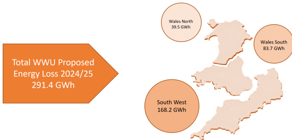
Figure 1: Breakdown of Energy Loss by LDZ

Please note the values contained within this document have been rounded to an appropriate level of accuracy. This may cause immaterial discrepancies between the totals presented within this document and the summation of their constituent parts, however each individual figure is correct in its rounded form. The Energy Loss for 2024-25 is estimated at 0.46% of total demand through the WWU system.